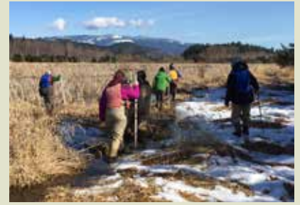
Volunteers at Green Road Marsh.

The ground was covered in snow on March 10th when 16 of our citizen science volunteers and land stewards visited Green Road Marsh to begin the annual survey of amphibians on Trust properties. There were no signs of eggs, but a few frozen juvenile amphibians came to life in the warm hands of the volunteers.