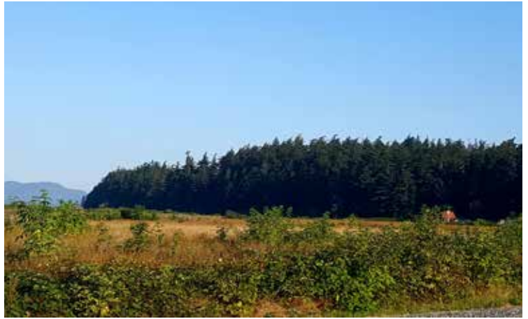
The forest of Samish Flower Farm as seen from the road to Samish Island.

Located at the entrance to Samish Island, Samish Flower Farm is the forested “coming home” view for Islanders and visitors. The 100+ year-old forest that encompasses both sides of Samish Island Road, provides nesting, roosting, perching, and foraging habitat for a variety of raptors such as the Bald Eagle, Osprey, Cooper’s Hawk, and owls, as well as migratory song birds. It is also a staging and feeding area for herons that nest nearby, and features 500 feet of natural shoreline that feeds into Padilla Bay.