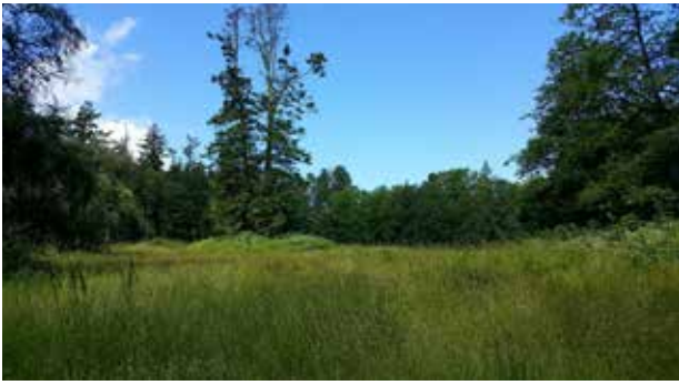
Wetlands in the forested upper portion of the property.