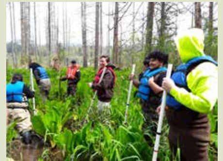
To the left: Emerson High School students surveying at Big Lake Wetlands as part of their Conservation Classroom program. They were great citizen scientists!