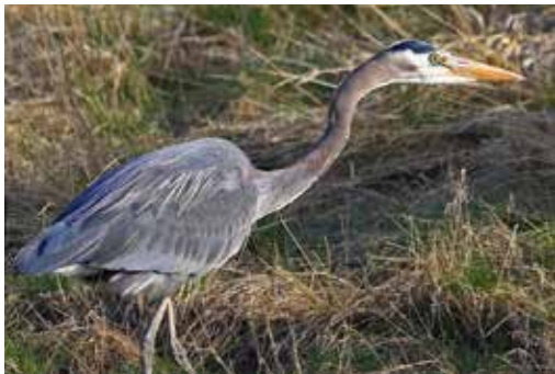
Great Blue Herons roost and feed on the Samish Flower Farm.