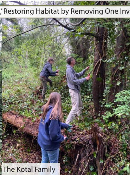
The Kotal Family