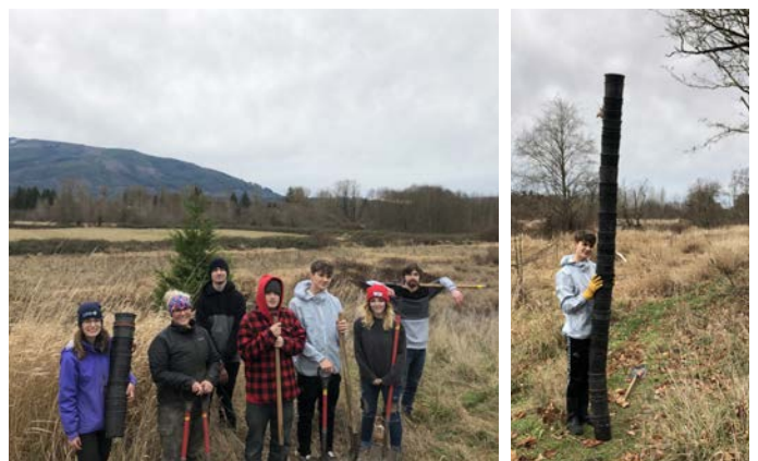
State Street students planting trees at Utopia Conservation Area.