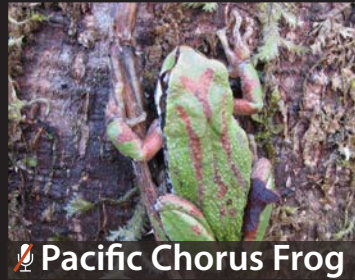
Pacific Chorus Frog