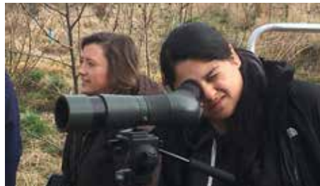
Walks will include opportunities to learn about and view birds found on the property

We invite you to join us for a tour of Barney Lake where we will look for beaver, great blue heron and other wildlife that share this land with us. During the walk, Trust staff will share the history of this property and how we hope to expand public access in the future. Most importantly, we'd like to hear your thoughts on how you would like to connect the community with these natural lands while protecting its wildlife. Please join us at one of our "Heron & Beaver & Frogs, Oh My!" walks in the month of May. See the Trust Events page for details.