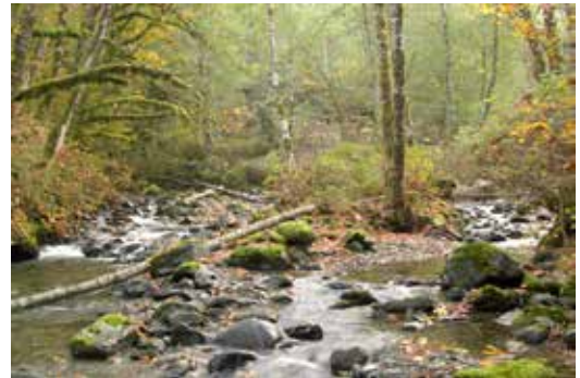
Cumberland Creek Conservation Area