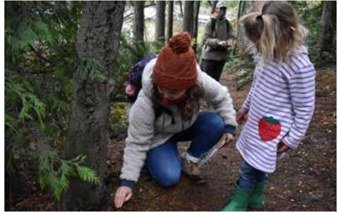
Left to Right: Community members hiking in the ACFL in the early 1980's; A family participating in a scavenger hunt event this fall in the ACFL hosted by Skagit Land Trust and Friends of the Forest.