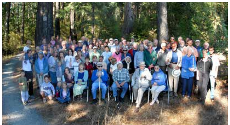
2008 Community Celebration of the ACFL Conservation Easement Program Partnership between the Trust, the City of Anacortes and FOF.

The City of Anacortes owns and manages the ACFL, but the Trust's conservation easement provides an essential backstop to ensure that the forestlands will never be logged, mined or subdivided and shall remain in their natural condition in perpetuity.