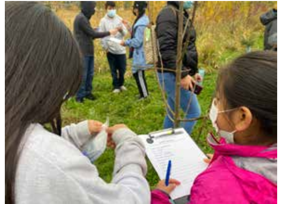
Youth from a nearby apartment complex on a recent fieldtrip to Barney Lake

In studying how to improve public access at Barney Lake, our goal is to create a low-impact, inviting experience for people without negatively effecting the birds, wildlife, or sensitive wetlands. To find this balance, we want to hear from the wide range of people who live and work near this conservation area, as well as others who would be excited to visit this place.