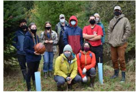
Left to right: Volunteers working on a new trail at Barr Creek Conservation Area; Youth from the Kulshan Creek Neighborhood Youth Program at Barney Lake removing invasive teasel; Students from Youth for the Environment and People (YEP!) program maintaining recent plantings at Tope Ryan Conservation Area.